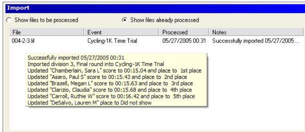
Illustration 9, sample file results

As each race's results are brought in, GMS reads the import files and matches up the entrants in the divisions by either the bib number (Scan-O-Vision) or GMS ID (Finish Lynx). It then imports the scores and places, marks the division as "Finished – Unofficial" and uses the file's timestamp to mark the division's end time (if scheduling is enabled).